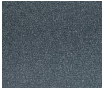
TSNDark Grey Matt