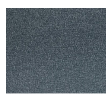
TSNDark Grey Matt