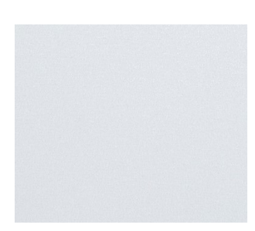
TSNLight Grey Matt